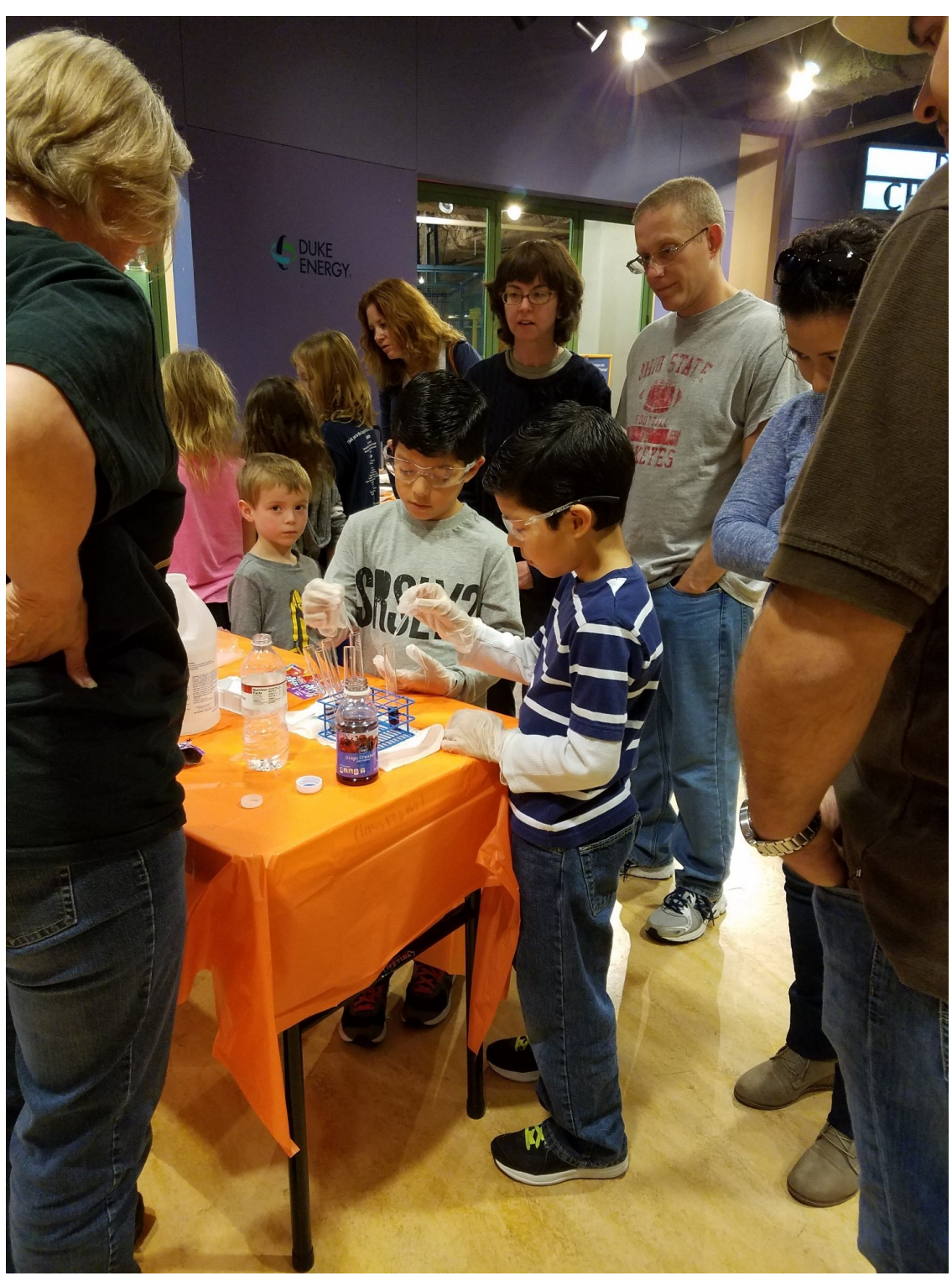
Using ammonia to find out which one was real fruit juice (Kool-aide vs. CranGrape)!